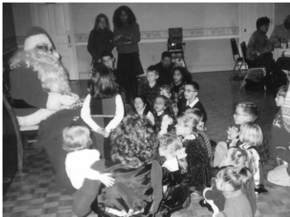
Beaver Rotary's annual holiday party provides an opportunity for Rotarians and their families to mingle and for children to receive gifts from Santa Claus