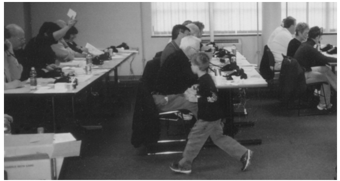
Above and left, the Rotary Radio Auction is our largest fundraiser, involving Rotarians and their families in a day of action. Held in April, the Auction raised more than $12,000 for Beaver Rotary this year.