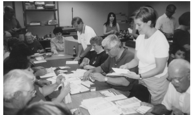
Left and above: The district-wide Ducky Derby race held on the Allegheny River in Pittsburgh is another major fundraiser. Right: Rotarians from Beaver and other County clubs donated 300 man-hours to stuff and stamp duck adoption certificates, with special thanks to Sky Bank for use of the workroom facility, and the Beaver County Times for its in-kind distribution of 46,000 certificates in one day's newspaper, a model adopted for the 2004 event throughout the Western Pennsylvania region.

To obtain a certificate, see the insert section of The Times on Friday or visit www.rotarypgh.org .