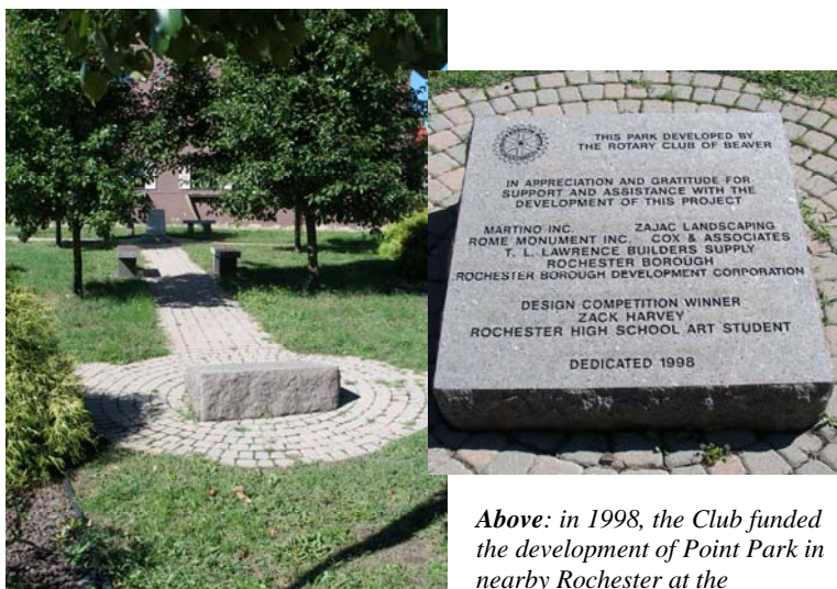
Above: in 1998, the Club funded the development of Point Park in nearby Rochester at the intersection of Brighton Avenue and Pleasant Streets.