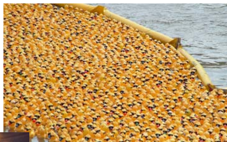
Left: we supported the Pittsburgh Rotary Club Foundation's annual Ducky Derby fundraiser for the third straight year.