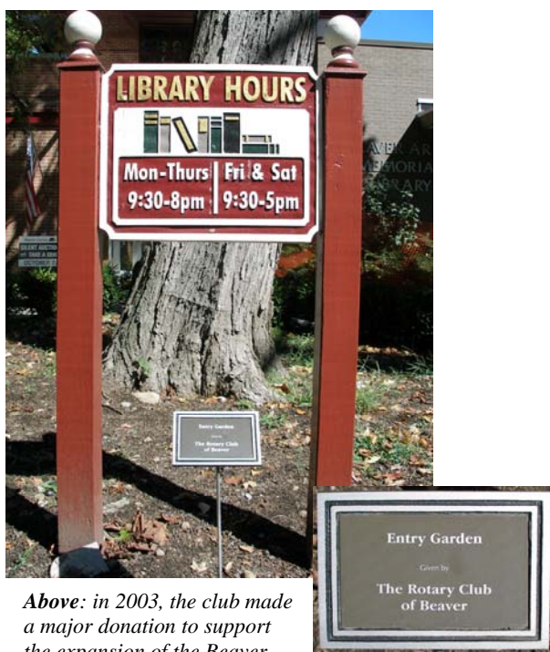
Above: in 2003, the club made a major donation to support the expansion of the Beaver Area Memorial Library.