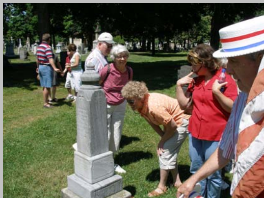
The Johnstown Flood baby's grave – re-marked by the Beaver Rotary Club – and a stop on the 2005 walking tour of the Beaver Cemetery