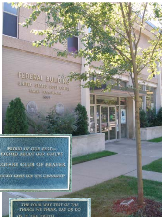
Above: in 2003, "frontier elm" trees were planted at the U.S. Post Office in Beaver, sponsored by Rotary, and marked with plaques.