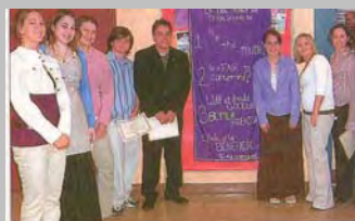
Bethel Park Interact Club

Bethel Park High School chartered an Interact club which is a service and social club for young people. Interact is a worldwide organization with 1,110 chapters in 115 countries.